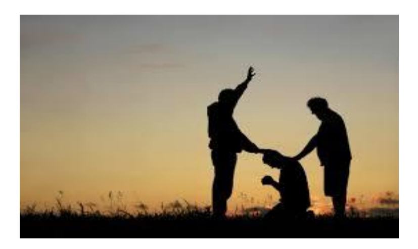
Mar 16:18 KJV They shall take up serpents; and if they drink any deadly thing, it shall not hurt them; they shall lay hands on the sick, and they shall recover.

FOR WHOM: For the unbelievers so as to demonstrate the kingdom