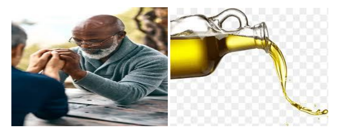
Jas 5:14 KJV Is any sick among you? let him call for the elders of the church; and let them pray over him, anointing him with oil in the name of the Lord:

FOR WHOM: For babies and not too mature carnal christians who need to feel something before they can believe.